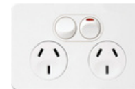
GPOs Hager Silhouette GPO. Matt white.