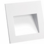
Wall lights UNIOS Cuadro 90mm LED Wall Light a