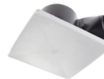
Exhaust fan and smoke detector Fantech Rapid Response ducted ceiling fan. Square grille 353 x 353mm.