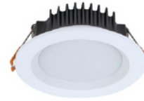
Downlights DOMUS Boost Trio 10W Downlight