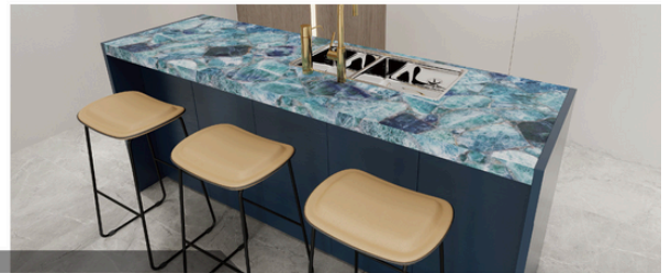
Code: SL7040 Size: 3200mm × 1600mm Thickness: 20mm/30mm