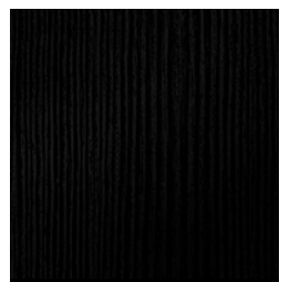
Impressions Black 460 Nuance Finish