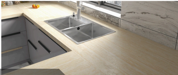
Code: LD 7004 Size: 3200mm × 1600mm Thickness: 20mm/30mm