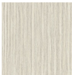
Impressions Alaskan 334 Nuance Finish